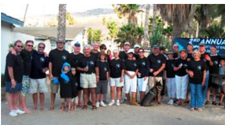
The Seawind Faithful