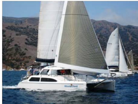
Cats on the Run

beque on the beach. As dusk fell, the beach barbeque was highlighted by a sighting of the International Space Station as it passed over Catalina. Saturday morning several boats from the fleet took up the challenge and raced around