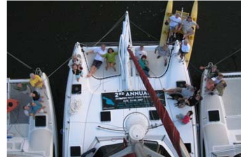
After Race Lounge

After the race we all rafted-up in the anchorage in Cat Harbor, what a sight to see 6 catamarans all tied together, we looked like a