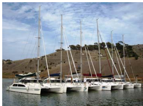
Cat Harbor Raft Up

the west end of Catalina to Cat Harbor. The wind was moderate and on the nose for the first leg so there was a lot of tacking and verbal exchanges as paths crossed. But as the fleet rounded the west end of the island and the wind angles improved, the speeds increased and the race was on. In the end, Sea Ya who was sporting new hull extensions, was the first to cross the finish line.